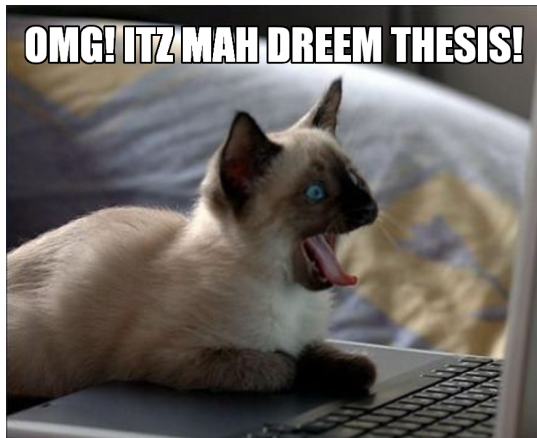
Fig. 1. The usual reaction of students upon visiting our theses pages and reading through the topics.

If you already have an idea that you would like to work on, you are welcome to propose own topics, as long as they align with our general domain of research. Again, finding a suitable supervisor is a crucial step. To find the right person to talk to, see the list of on-going [43] and finished [42] theses. Then, just write them an email detailing your idea 3 . Please beware that all your communications for the thesis need to be secured via KIT S/MIME certificate. For this purpose, you need to obtain a KIT email address which includes your name (Please don't use the wxyz@student.kit.edu) and request a S/MIME certificate for it. It may take about a month to get your new email address with your name and S/MIME certificate, so you can use the existing KIT email address for the first month. For further information please contact SCC.