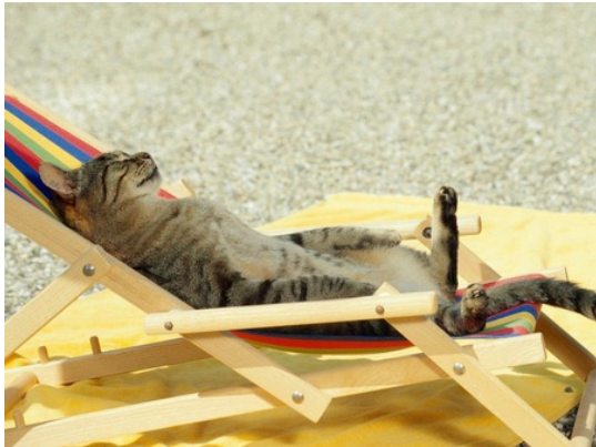
Fig. 4. Having finished your thesis you earned yourself some time off! (That is assuming there are no lectures or exams left for you. In that case: Back to work!)

After you handed in your thesis, gave the second talk and mastered all the strange questions from the audience, you are officially done! Congratulations! The only thing you have to do now is relaxing and enjoying your free time (see Fig. 4). You will be notified once the grade is set.