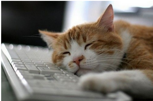
Fig. 3. We strongly advise you to start producing text early. Putting off the writing to the last point in time possible will exhaust you and cause nothing but stress!

At some point in time you will realize that you are done. Depending on the current state of your thesis you might have a hard time believing this. Rest assured, however, the day will come when your thesis is finished and you can hand it in (or you tried to pull the all-nighter stunt and are not only done but also done for; see Fig 3).